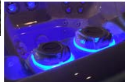
AIR & WATER DIVERTERS