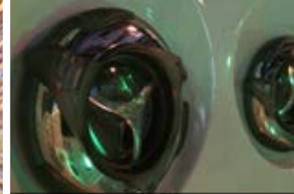
ADJUSTABLE STAINLESS STEEL JETS