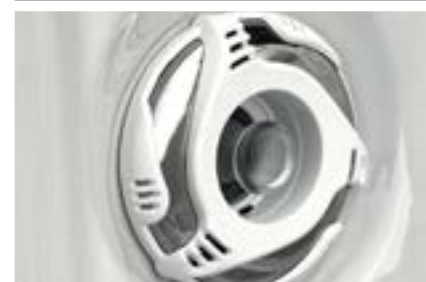
OPTIONAL JET COLOR PACKAGE