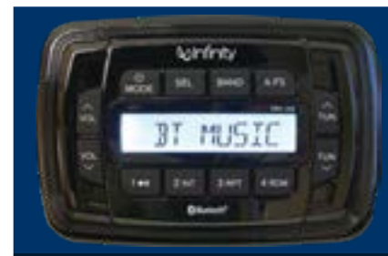
INFINITY™ AUDIO SYSTEM