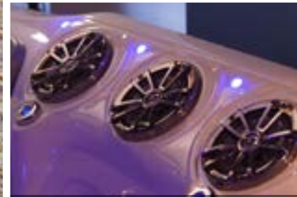
INFINITY™ AUDIO SYSTEM