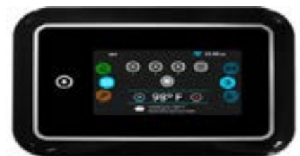
USER FRIENDLY, DIGITAL CONTROLS